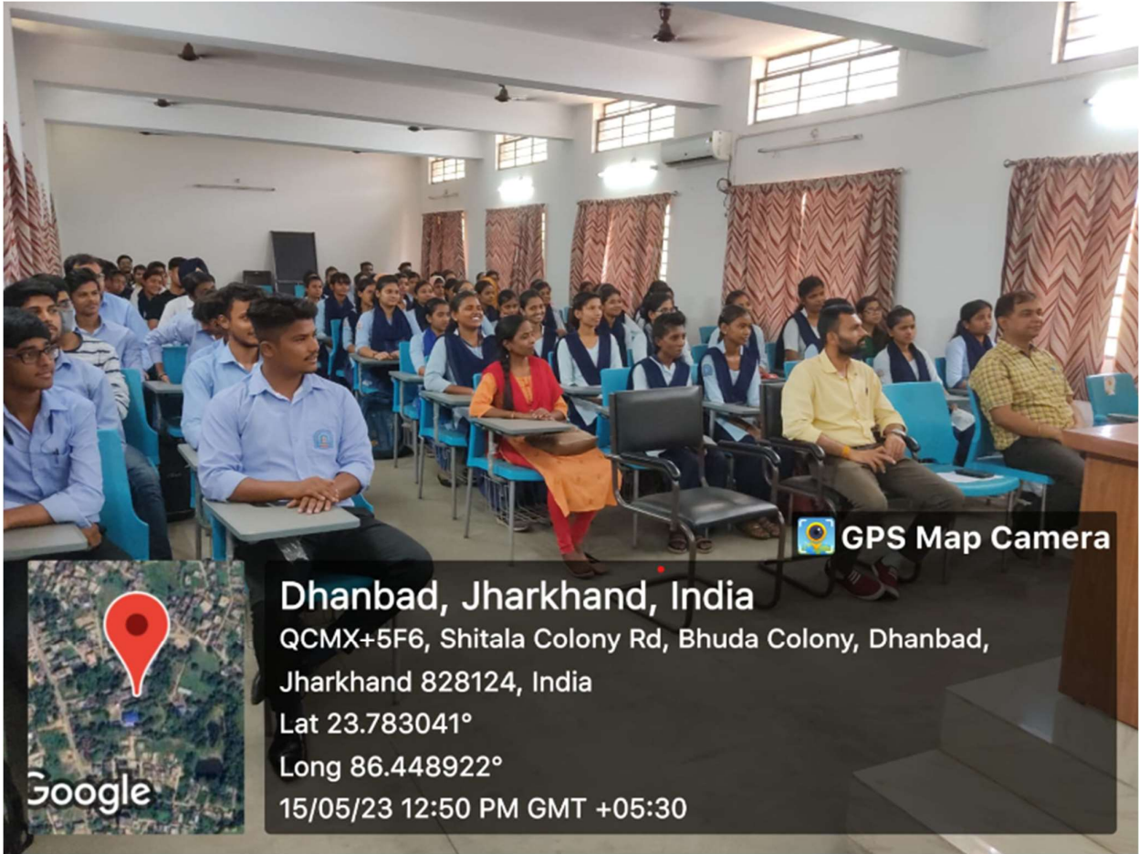
Participation of students and faculty members